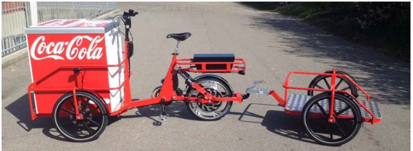
CargoMaster Light with fridge

Options: Any customised box after customers wish (see some examples next page)