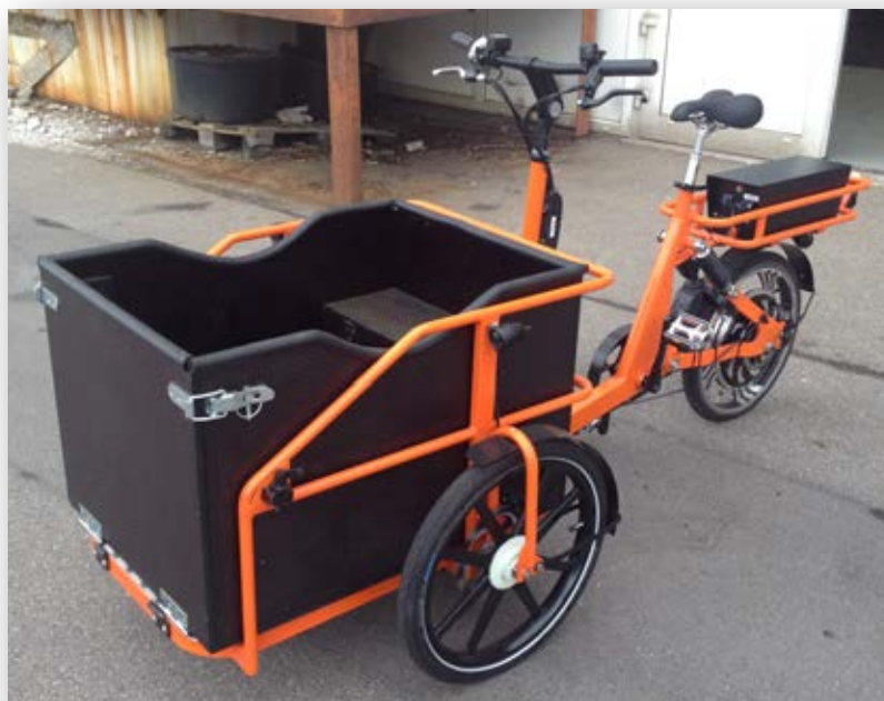
CargoMaster with children transport box