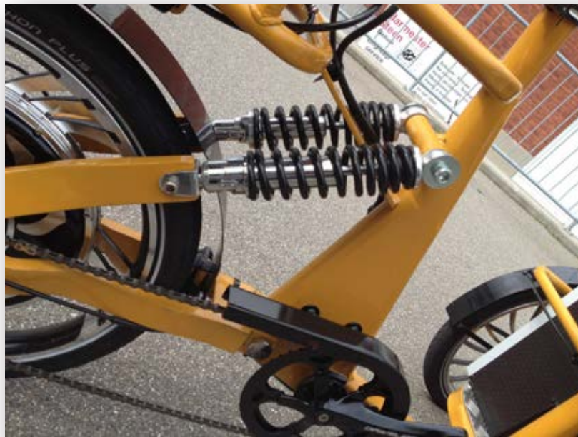
Schocks on rear fork