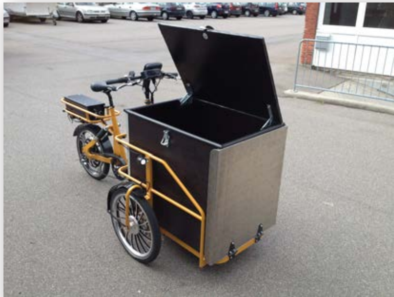
CargoMaster with transport box