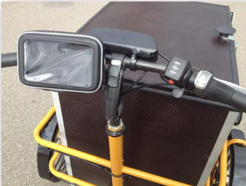
Fully adjustable steering, 6 gear shift, switches and case for iPhone