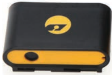
GPS Anti Teft Position Tracker