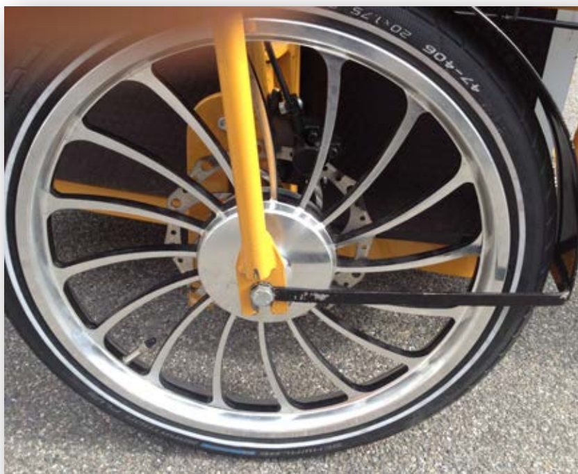
Hydraulic disk breaks and alu-wheel rims