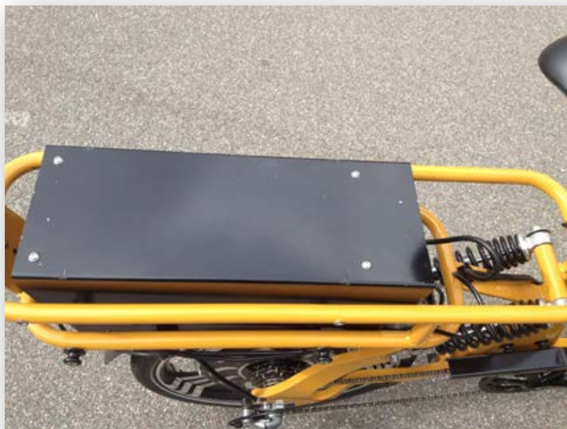
Water proof removable battery box in alu-casing