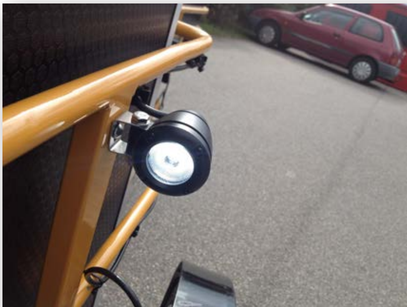
Led lights, very strong but with only 7 W consumption